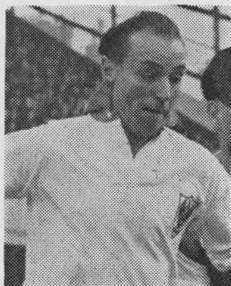
Matthews in action in a recent English game.

A quiet, unassuming man, Stanley Matthews keeps a hotel in Blackpool, and has shown astute business sense in capitalising on his prowess as an international footballer of world repute by forming himself into a registered business company. "Stanley Matthews Ltd." is a new firm with a name that has hit the sporting headlines of the world Press for the past twenty years, and Matthews is still going so strong that his registered company looks like being called the "old firm" in years to come.